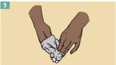
5 Turn the second glove inside out while pulling it away from your body, leaving the first glove inside the second.