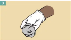
3 Hold the glove you just removed in your gloved hand.