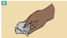
6 Dispose of the gloves safely. Do not reuse the gloves.